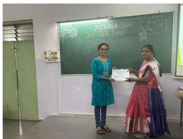
Participants honored with Certificates

The event also provided a platform for the students to network with industry professionals, opening doors for potential internships, collaborations and future job opportunities.