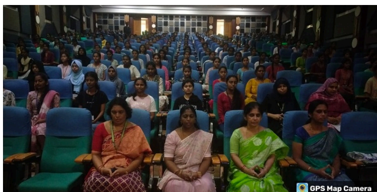
Embracing Serenity: Staff and Students Unite in Meditation at BRECW

Participants likely engaged in practical sessions designed to enhance their focus, inner peace, and overall well-being. The program may have included teachings on breathing exercises, mindfulness practices, and the benefits of regular meditation for academic and personal growth.