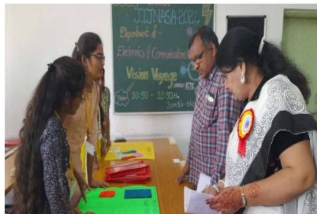
Participants in discussion with Judges

Participants demonstrated their dedication to practical application of knowledge, reinforcing their readiness to tackle complex global issues through innovative projects. Vision Voyage celebrated the spirit of creativity and problem-solving, inspiring a new generation of forward-looking engineers and innovators.