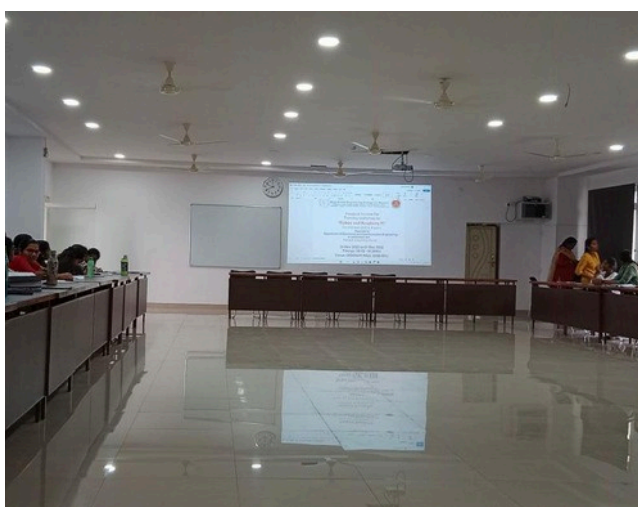
Schedule of "Machine Learning & AI using Python" Workshop