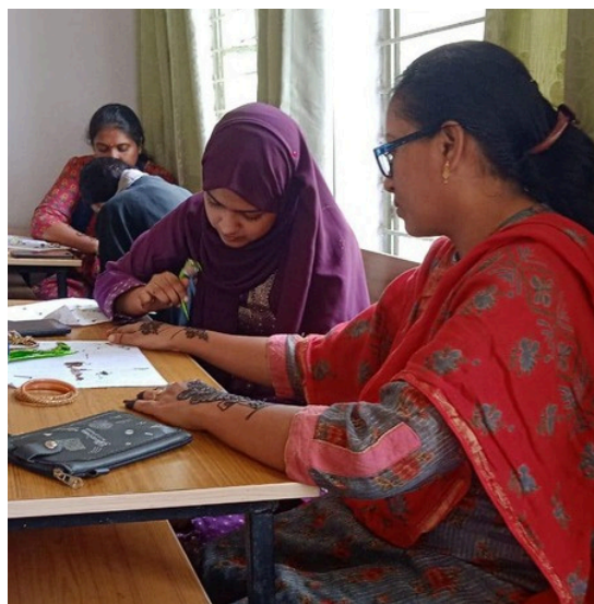
Glimpse from Mehendi Competition

“Celebrating Women, Embracing Culture: Uniting Strengths, Inspiring Change”