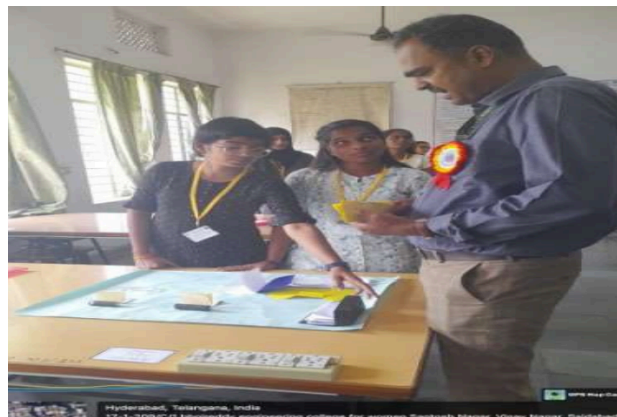
Participants showcasing their Posters

The exhibition provided a platform for students to collaborate, share ideas, and receive constructive feedback from peers, faculty, and industry professionals. This helped refine their projects and encouraged interdisciplinary collaboration.