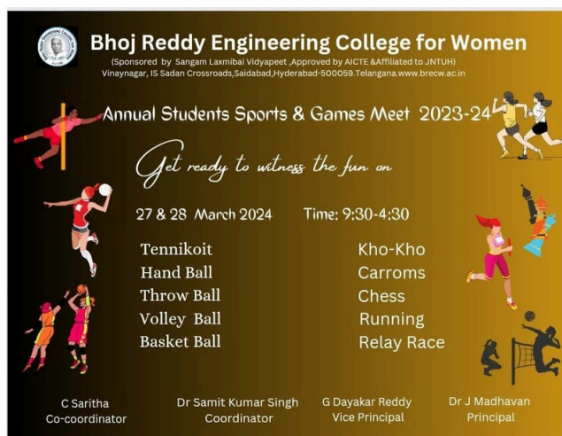
Invitation of Annual Students Sports & Games Meet

Beyond the thrill of victory and the agony of defeat, the Sports & Games Meet at BRECW fosters a sense of unity and pride among students, as they come together to cheer for their peers and celebrate the achievements of their fellow athletes. It's a reminder that success is not just individual, but collective. The Sports & Games Meet at BRECW fosters unity and pride among students, celebrating both individual achievements and collective spirit through spirited competition and camaraderie.