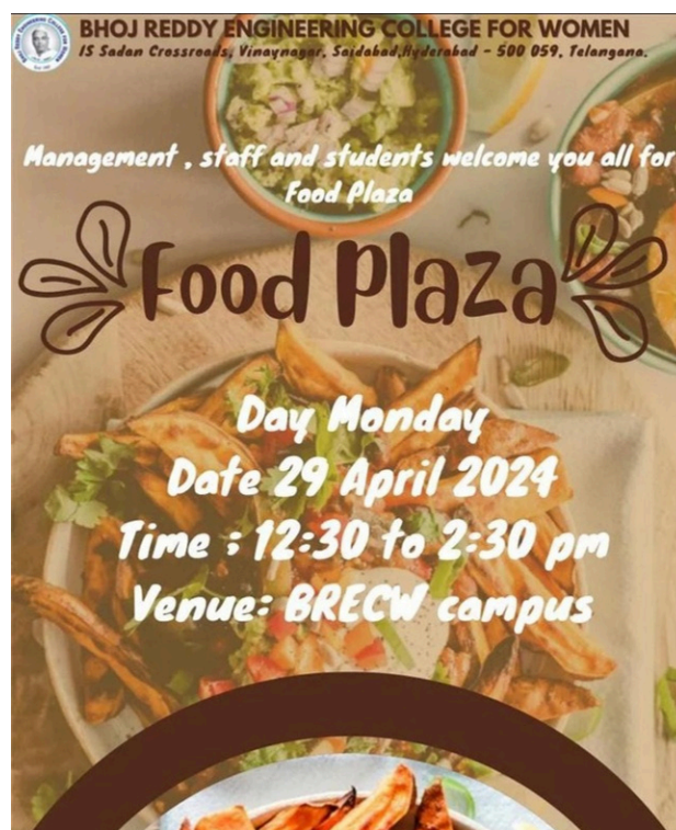
Invitation of “Food Plaza”

The fest was more than just a gastronomic adventure. It was a celebration of community and creativity.