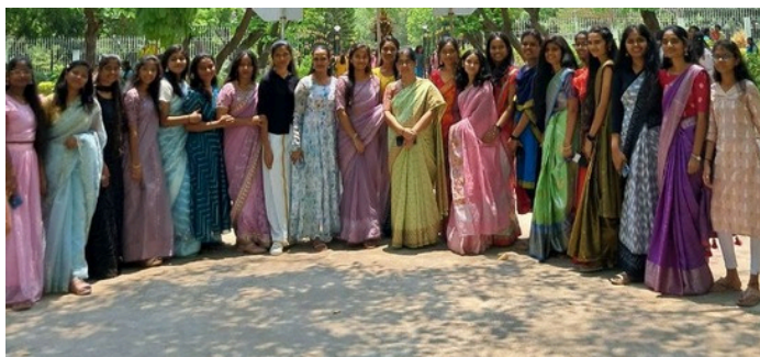
Students participating in Traditional Event

As the sun set, the campus transformed into a vibrant tapestry of lights and colors. Traditional music and dance performances filled the air with joy, while students in their cultural attire mingled and celebrated. The Mehendi Competition winners, with their intricate designs, received their awards amidst applause and cheers. This event, rich with tradition and camaraderie, left a lasting impression, highlighting the beauty of cultural heritage at BRECW.