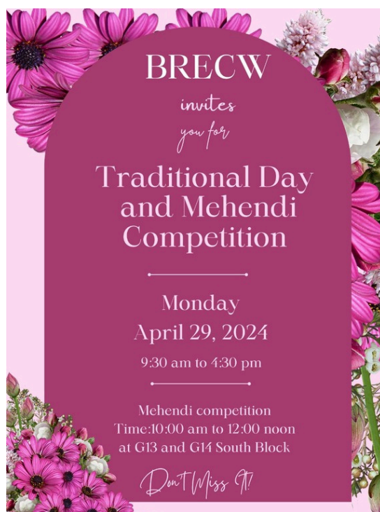
Invitation for Traditional day & Mehendi competition