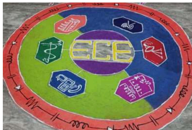
Rangoli at JIINASA Eventt

Students participated in innovation challenges that required them to think creatively and develop quick, effective solutions to presented problems. This not only tested their technical skills but also their ability to innovate under pressure.