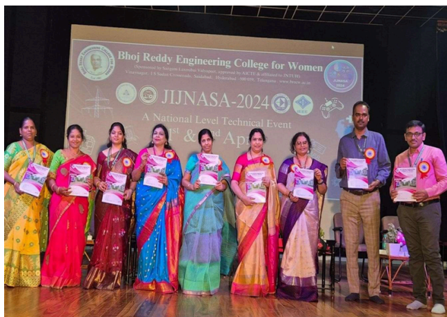
Inauguration of JIJNASA Fanzine