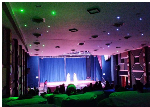
Highlights from Farewell Day Performances"

As the curtains close on Farewell Day at BRECW, let's embrace the future with gratitude for the past, carrying cherished memories and lasting friendships into the journey ahead.