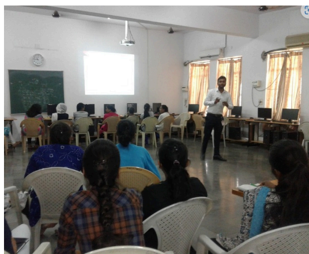
Captivating moments from our enriching workshop - where learning meets innovation!