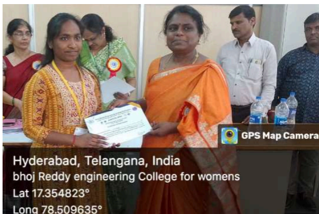
Participants honored with Certificates

Workshops covered a range of topics from basic circuit design to advanced electronics, helping students develop both foundational and specialized skills. These practical experiences were crucial in bridging the gap between theoretical learning and real-world application.