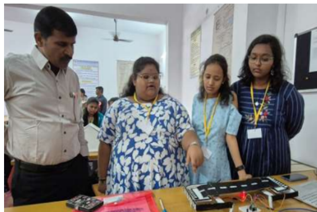
Participants showcasing their Models

The event emphasized teamwork and collaboration, with participants working in groups to tackle technical challenges and develop innovative solutions. This fostered a spirit of camaraderie and enhanced their problem-solving and teamwork skills.