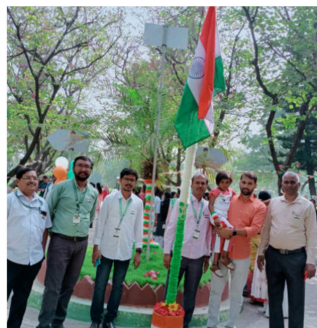
Saluting the spirit of unity and patriotism on Republic Day!

The celebrations continued with cultural performances that highlighted India's rich diversity and heritage, showcasing traditional dances and recitals. Students and faculty came together in unity to commemorate the sacrifices of our freedom fighters and reflect on the significance of democratic values. The event concluded with a pledge to uphold the principles enshrined in our Constitution, fostering a sense of national pride and unity among all participants.