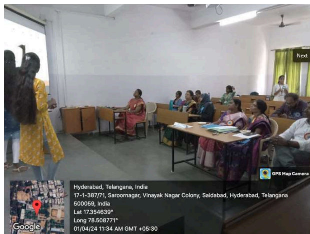
Participants presenting their paper

The event encouraged interactive discussions and Q&A sessions, allowing students to engage directly with the speakers, ask questions, and gain deeper understanding of the topics covered. This fostered a dynamic learning environment and inspired students to explore new areas of interest.