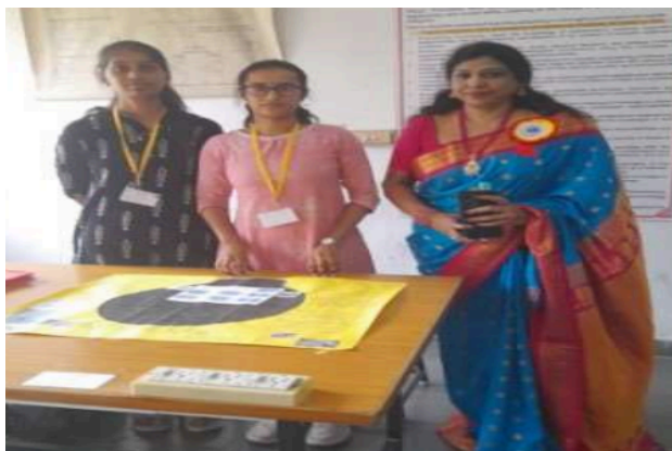
Our Director of HR & Academics with participants

The event underscored the commitment of our students to driving forward-thinking solutions that contribute to societal advancement and technological innovation.