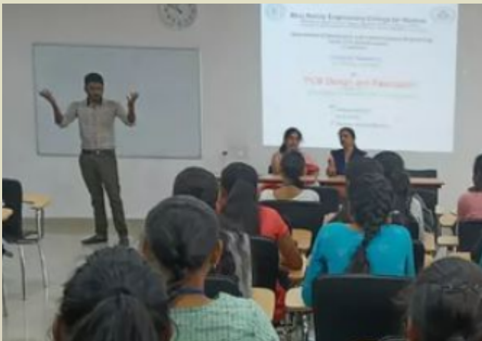
Students sinking in the subject.

Technotran, is set to take place on the 10th and 11th of October 2019. Technotran is designed to build on the foundation laid by the previous workshop, offering advanced training and deeper insights into PCB design and fabrication. This follow-up workshop focuses on more complex design challenges and introduces students to advanced fabrication techniques.