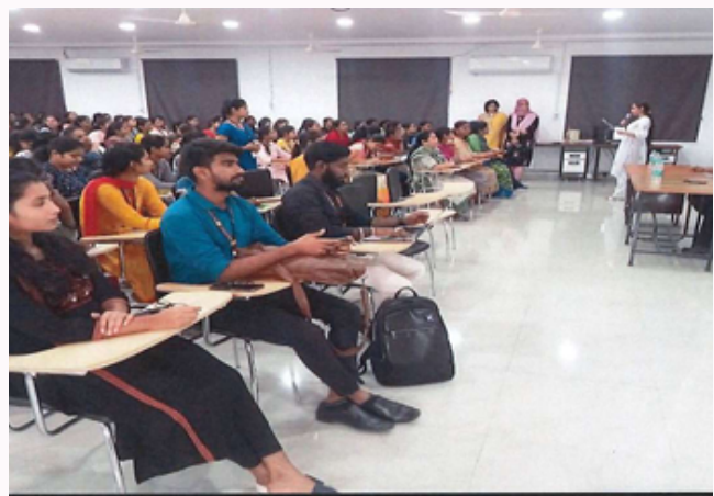
Motivating students with effective sessions.