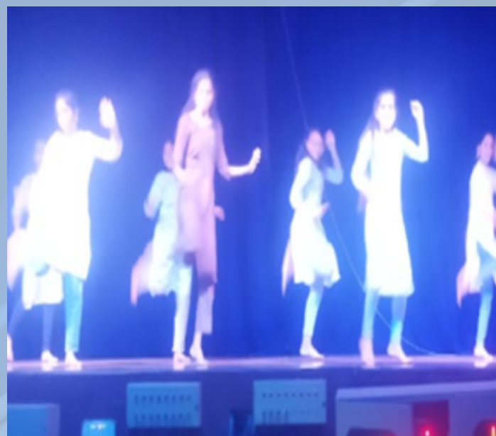
Students Tapping their feet with joy