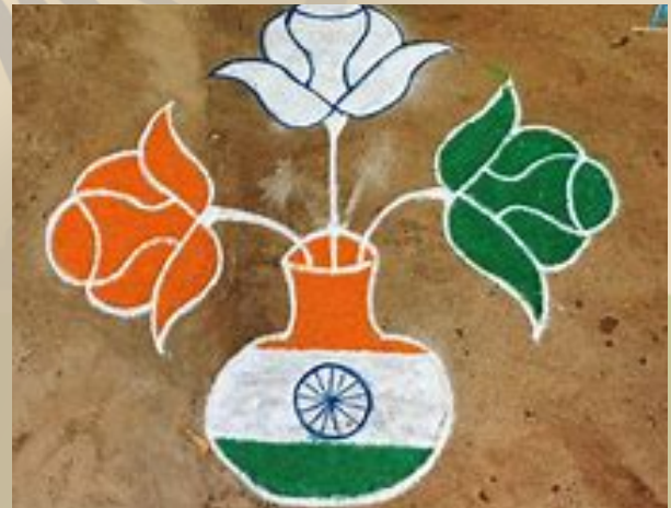
Display of Patriotism in the form of Rangolis

The Independence Day celebration at BRECW College is not only a tribute to India's glorious past but also an inspiring reminder of the collective responsibility to uphold the values of freedom and unity for future generations.