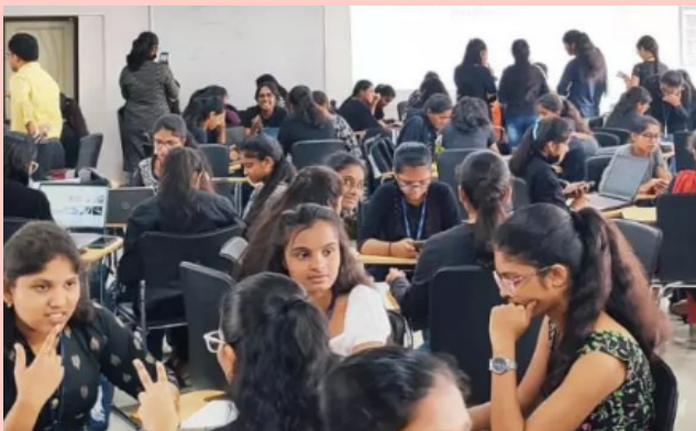
Active involvement of students.

The Digital Image Processing workshop for the III B Tech ECE students held in, 2019, under the auspices of Technotran. This event focuses on providing in-depth knowledge and hands-on experience in the field of digital image processing. Participants engage in various sessions that cover fundamental concepts, advanced techniques, and practical applications of image processing technologies.