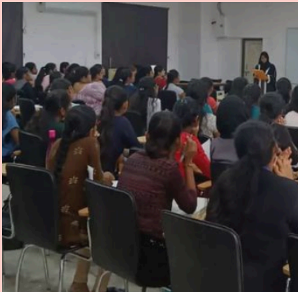
Students indulging in the lecture.