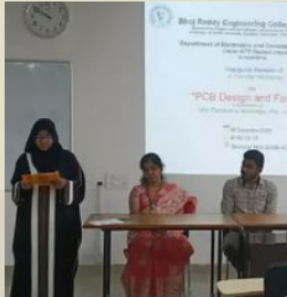
Faculty giving their insights.