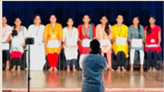
Merit & Attendance Awardees

Merit and attendance awards at BRECW College serve as powerful motivators for students to excel both academically and in their attendance records. These awards recognise and celebrate the hard work, dedication, and commitment demonstrated by students throughout their academic journey.