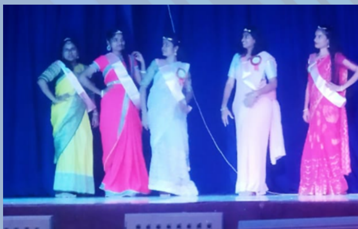
Ramp walk of our freshers 2019

The highlight of the evening is the time, where freshers showcase their skills in singing, dancing, and acting. Each performance is met with loud applause and cheers, reflecting the supportive and inclusive environment BRECW College prides itself on.