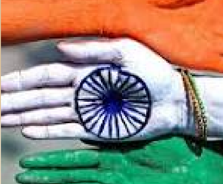
Beautiful colours of Indian Flag

Every year, Independence Day is celebrated in India on 15th August with great grandeur and pride. The Independence Day celebration at BRECW College is a vibrant and patriotic event that brings together students, faculty, and staff to commemorate this historic day. The festivities commenced with the hoisting of the national flag, accompanied by the resonant strains of the national anthem, which instills a deep sense of pride and unity among all the attendees.