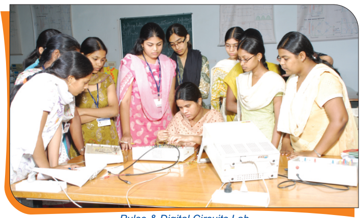
Pulse & Digital Circuits Lab