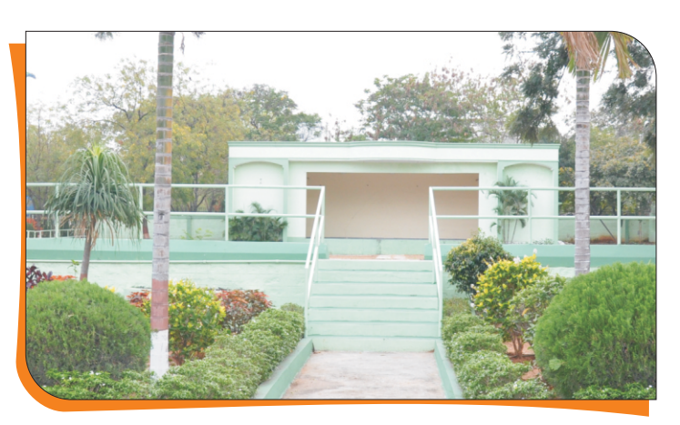
Open Air Auditorium