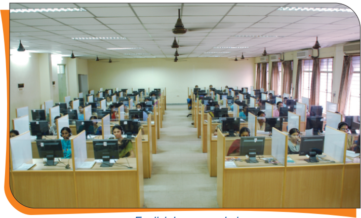
English Language Lab

The academic performance of our students has been consistently outstanding with a pass percentage of 85 to 90.